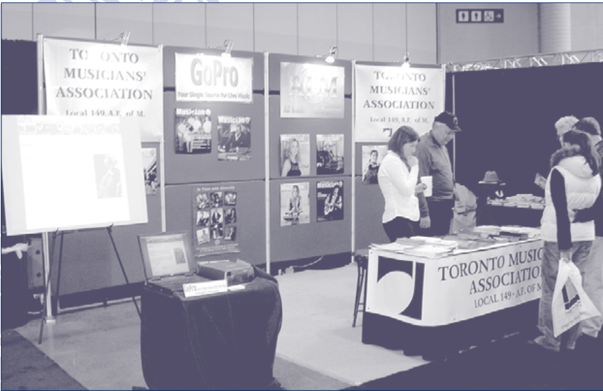
The TMA booth at the Toronto Music Expo (TMX).

2006: A New Year, New Opportunities, a New Board of Directors, and the work continues. March 23, 2006, opening night of The Lord of the Rings , promises to be an auspicious date for the revitalization of large-scale commercial theatre in Toronto. There is no question that the drastic downturn in tourism that Toronto suffered in 2003 and 2004 — which precipitated the premature closing of the excellent productions The Producers and Hairspray — had the effect of discouraging producers from mounting open-ended commercial productions in